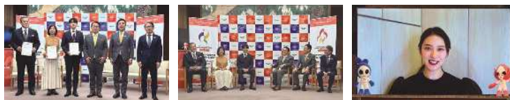
Scenes from the Appointment Ceremony

These ambassadors will support the Games by participating in official events and sharing information through social media, newsletters, and other promotional platforms.