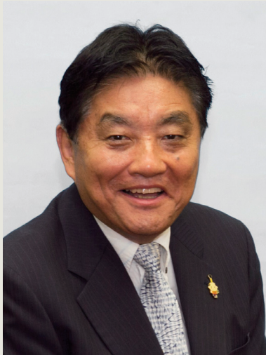
Takashi Kawamura Mayor of Nagoya City

The City of Nagoya is proud to join Aichi Prefecture in developing a concept for hosting the 20th Asian Games.