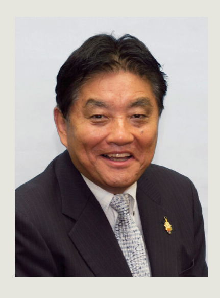
Takashi Kawamura Mayor of Nagoya City

The City of Nagoya is proud to join Aichi Prefecture in developing a concept for hosting the 20th Asian Games.